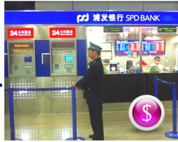
Opposite to the exit you can see the counters of SPD Bank for currency exchange