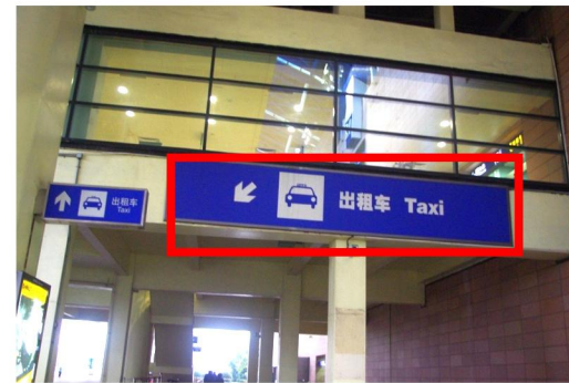
4. When you get out of the Gate 11, turn right. You will see this sign.