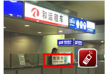
2. At the exit, if you turn left and walk for about 50m, you will see a counter that sells phone card (it closes at 8pm).