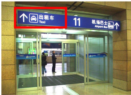
3. You can leave the arrival hall from Gate 11 which is next to the SPD Bank.