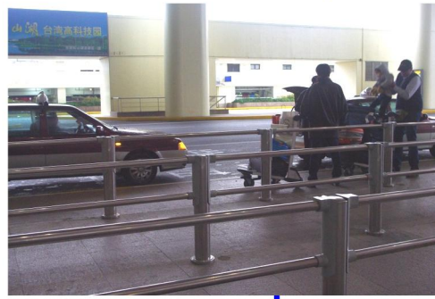
5. Keep walking (for about 20m) and you will see the taxi stand.